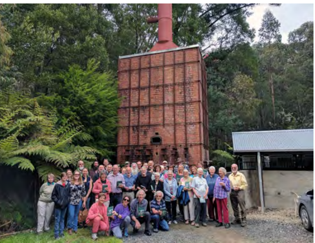
Group photo in front of the kiln